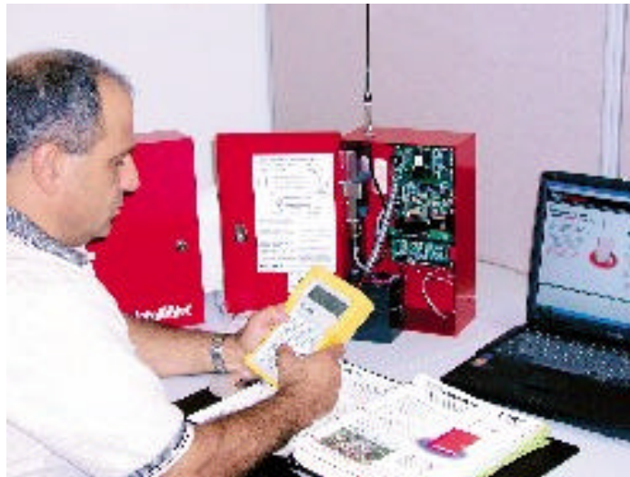
A technician from Protection Systems, Phoenix, Arizona programs a long-range AES Intellinet transceiver for a new fire alarm system about to be installed in the Phoenix area.

The Boston fire took place at 83-85 Summer St. A day and a half later, 776 structures lay in ruin, 13 people were dead, and upwards to $76 million in public and private funds were lost.